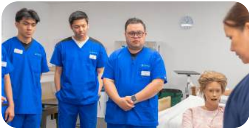
Entry-level professional practice

Graduates of the Diploma in Nursing programme have a wide range of career opportunities in both public and private healthcare sectors. These include: