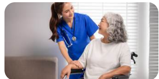
Nursing Homes Provider