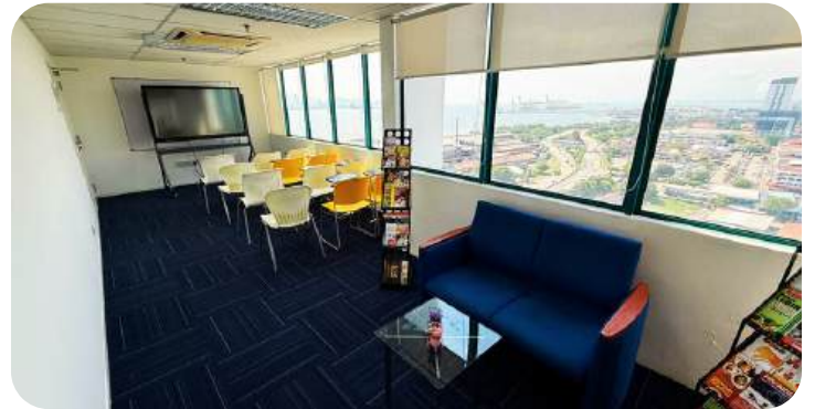
Health Education Corner