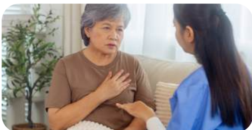
Public Health Advisor