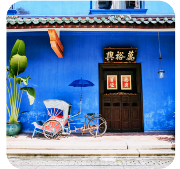
Cultural & Heritage Learning Experience