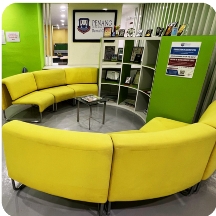
Student Reception Area