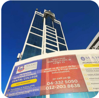
Reputable Education & Healthcare Hub