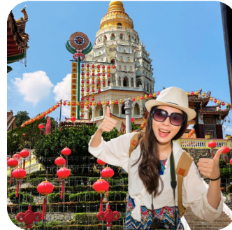
Safe, Student-Friendly City