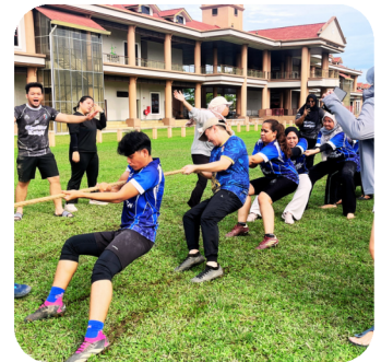
Vibrant Student Community & Activities