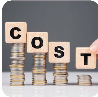
Affordable Student Living