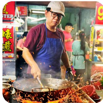
Excellent Food Culture